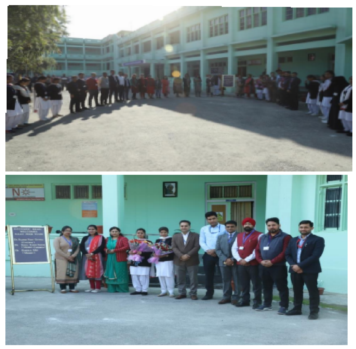
College Principal, Faculty and Students waiting for the Naac Peer Team

A two day NAAC peer team visit concluded at Govt. General Zorawar Singh Memorial Degree College Reasi today on 16<sup>th</sup> March, 2019. The NAAC Peer team visited the Govt. General Zorawar Singh Memorial Degree College, Reasi to assess the performance of the institution for the first cycle of NAAC Accreditation.