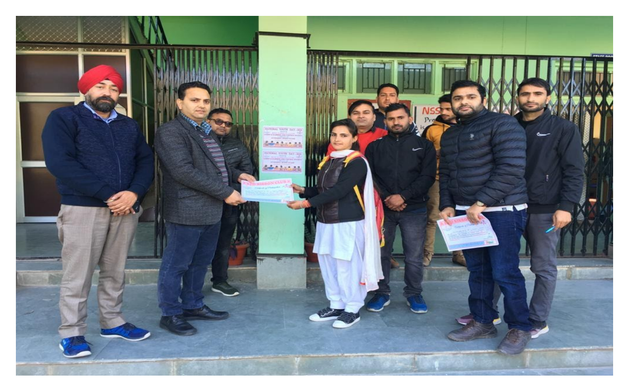
"Be the Change that you want to see in the world"