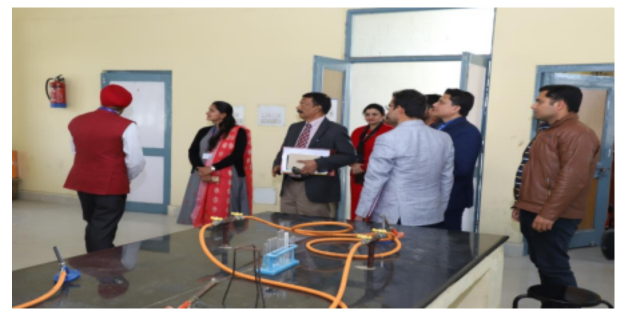
NAAC peer team members inspecting Science Labs

They also visited the NSS Cell and inquired about various activities undertaken by the NSS Unit of the College.