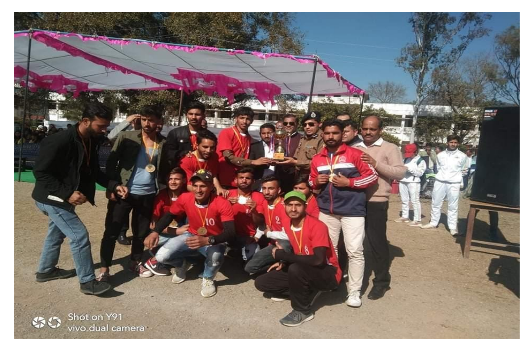
GDC Reasi boys won silver medal in KHO-KHO.