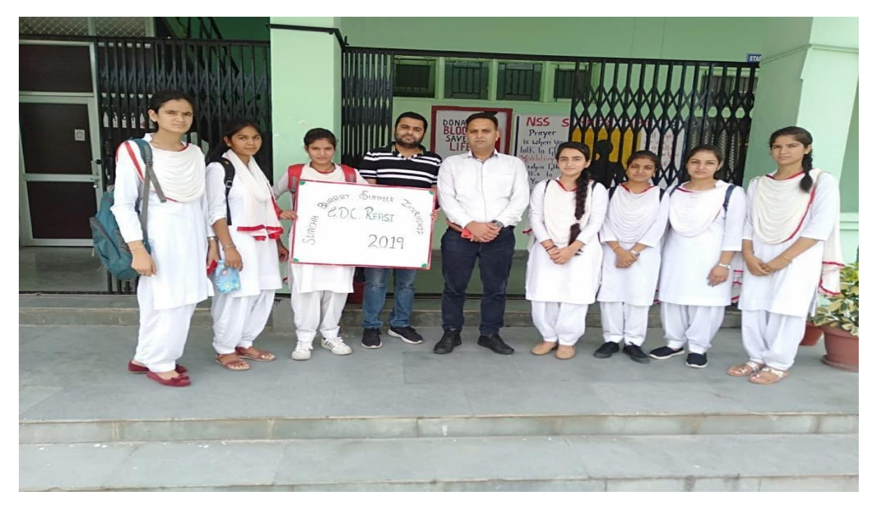
"Our country is our identity so keep identity clean'