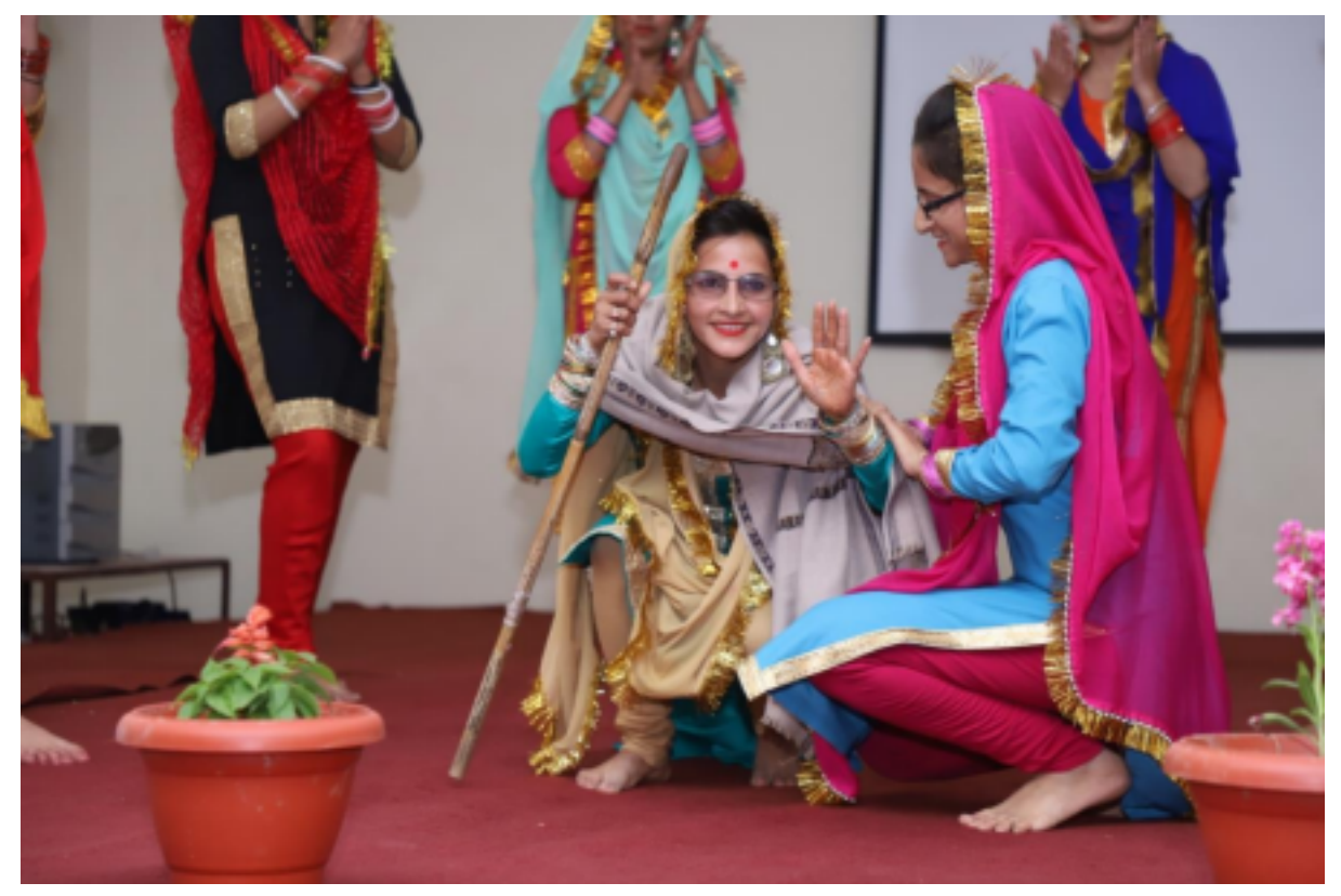
The college students performing Dogri folk dance called Jagrna showcasing the cultural diversity of J & K UT.