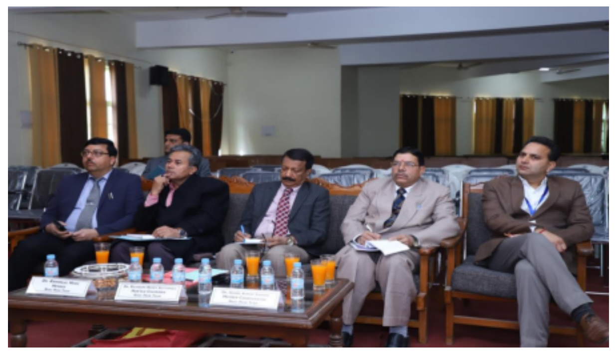
NAAC peer team members assessing the faculty presentations.

The team interacted with all the Heads of the Departments in the MP Hall wherein detailed departmental profiles and activities were presented through power point presentations.