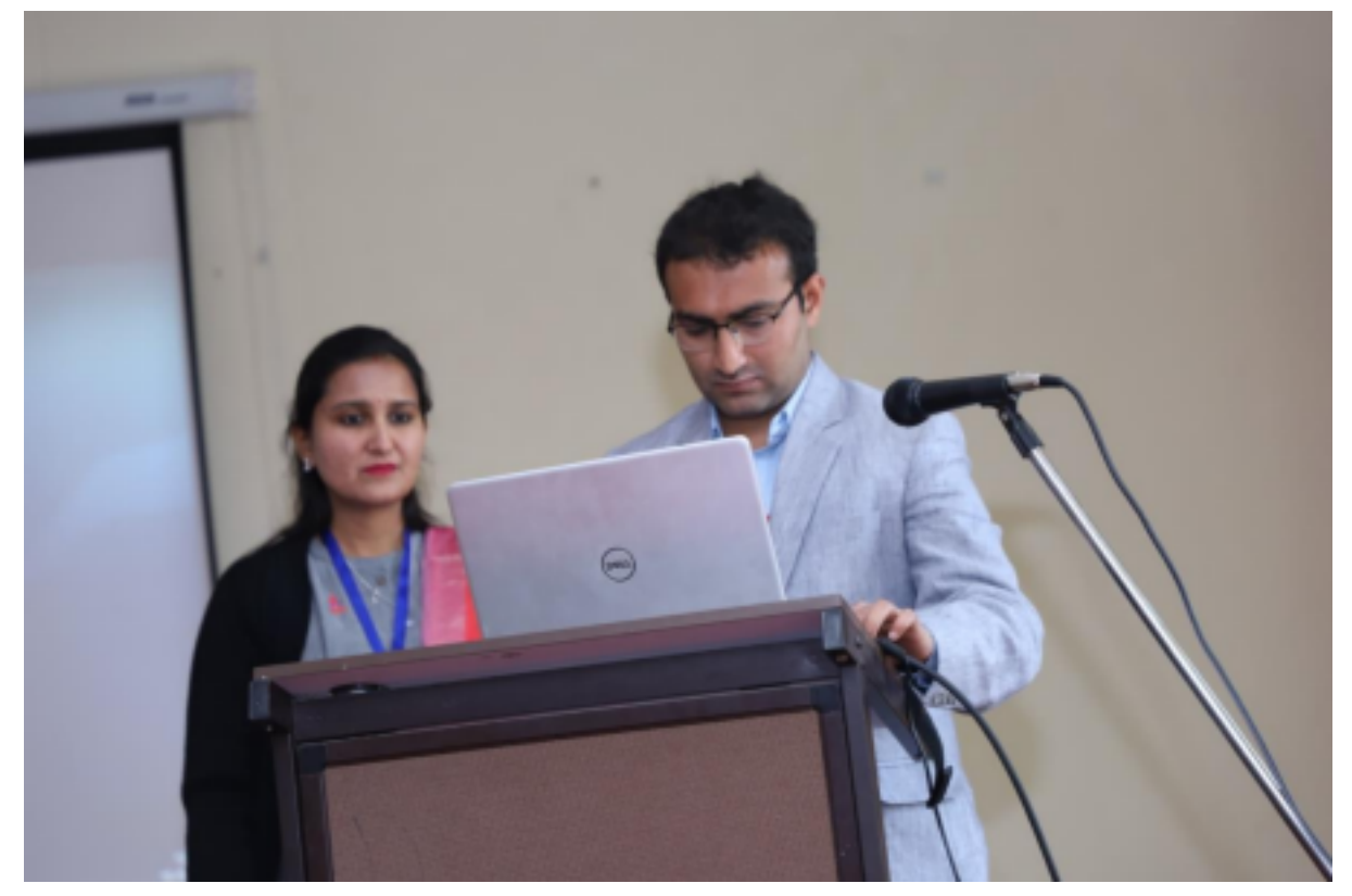
Faculty's presentation to the NAAC team.