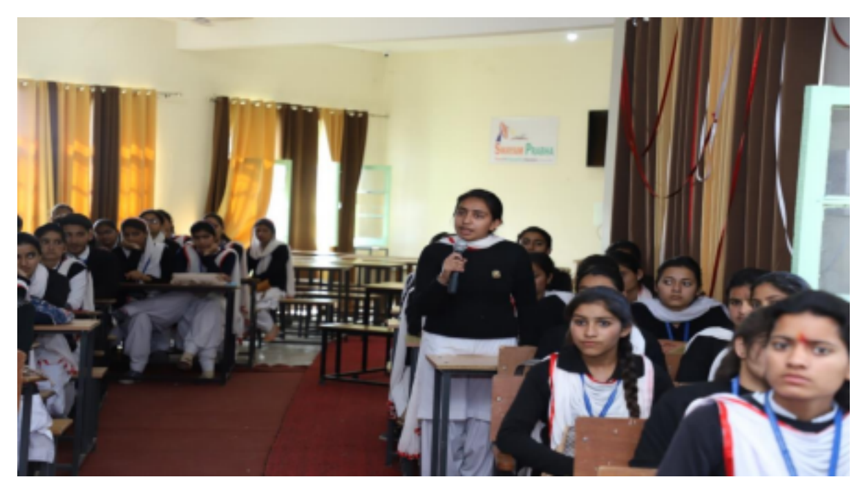
NAAC peer team members interacting with the students