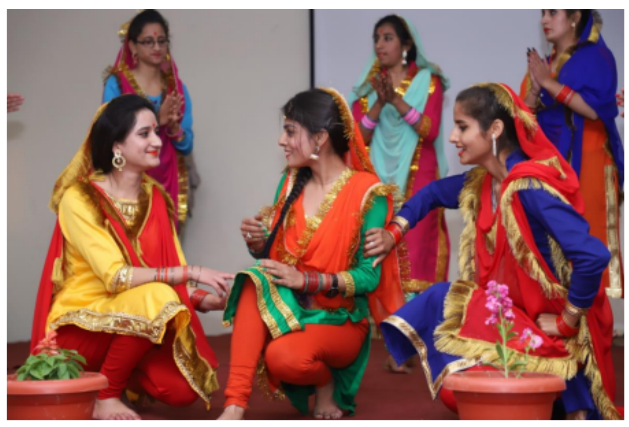
The college students performing Dogri dance showcasing the cultural diversity of J & K UT.